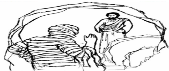
Jesus Raised Lazarus from the Dead

The theme for the 5th Sunday of Lent is: The glory of God shines through us when we remain steadfast in our faith. Our faith in God can help us triumph over the passion we share with Jesus - all the problems, struggles and difficulties we face in life - just as it can overcome our fear of death - and death itself.