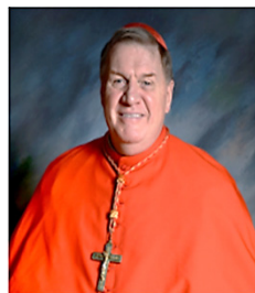
Archbishop of Newark