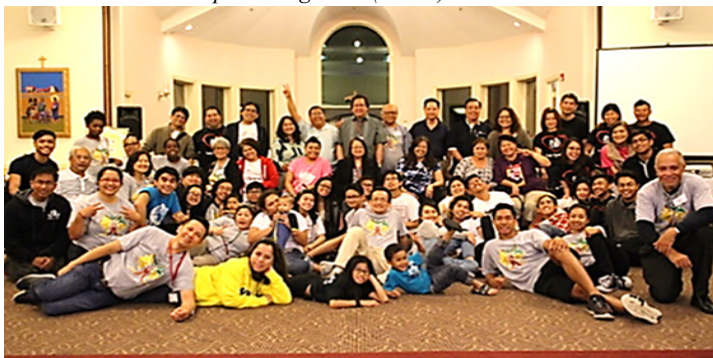
A pdf of this Covenant News and more information about BLD are available online at BLDNEWARK.com

Pictured below - the sponsoring class (FE 23) and auxies: