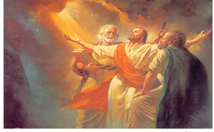
...Continued on page 3