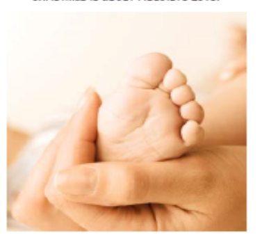
It's about our God, Who despite absolute power, Is first Absolutely Love."

"Because it's about Love Christmas is about Absolute Love.